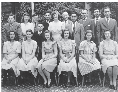
The first SAIS graduates in 1945.